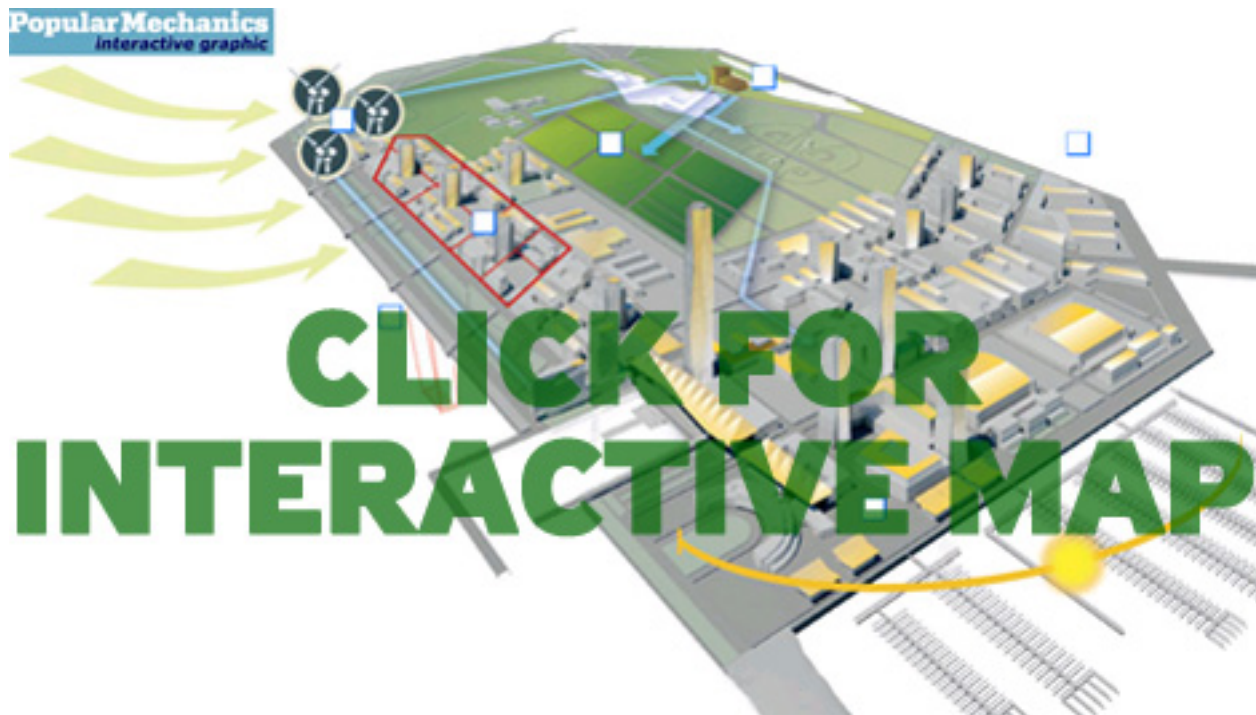
Illustration by Gil Ahn

It is a weekday morning and Treasure Island feels deserted – more like a ghost town than a community of nearly 3000 people. For basic services, schools and jobs, most residents have to leave the island, by car or by the one bus that passes through on its route. Rogers and I drive north on the empty roads, past a pair of star-shaped military barracks that date back to the 1950s, and turn into a housing development built by the Navy. Long curving streets lead past ranch-style houses and end in cul-de-sacs. Cars line the curbs and fill every driveway.